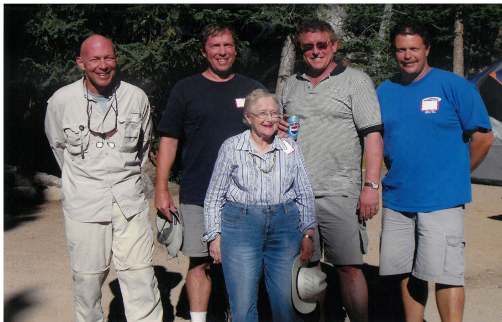
The Mazarella Brothers